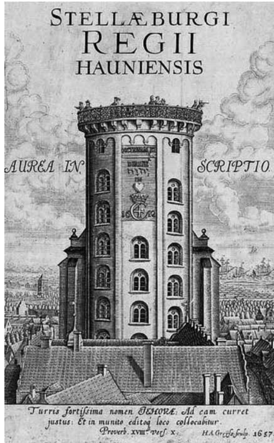
Figure 2. The Round Tower in Copenhagen with its observatory platform.

the heavens that would surpass even those uncovered by Galileo, he was sceptical with regard to its use in astronomy: “This optical apparatus [...] has not, according to my judgment, been very important with respect to the progress in astronomy. For astronomy does not so much investigate the heavenly bodies themselves and their casual properties as [it investigates] their motions and definite periods; it hands over the peculiarities of the stars to physics, which treats them by means of optics.” That is, even though Longomontanus admitted that the telescope offered some advantages, he did not consider it essential for astronomical purposes. It was of little use for positional astronomy and, moreover, would not help determine whether the Copernican or the Tychoenic world system was the right one.