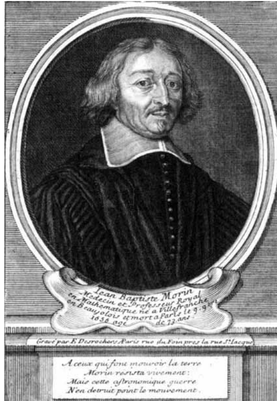
Figure 4. Jean Baptiste Morin (1583–1656). Plate by Étienne Desrochers.

Longomontanus seems to have valued Morin as an astronomer and mathematician, and in the 1630s the two exchanged several letters. Frommius too admired Morin, whom he wished to meet during his journey in the Netherlands. Armed with a letter of recommendation from Longomontanus he planned to go to Paris to discuss Morin's theory of the longitude with him, but it is uncertain if the two