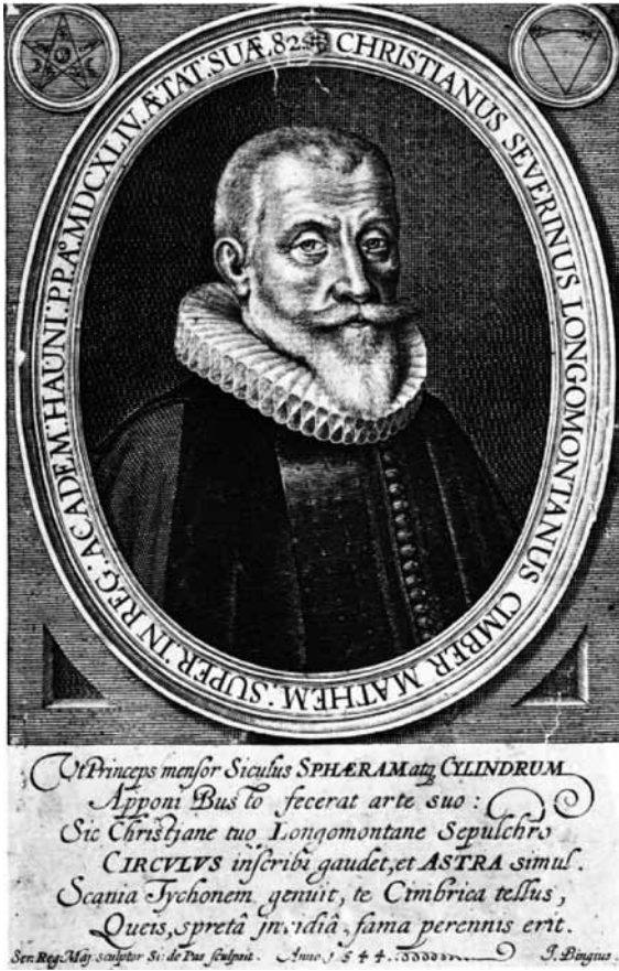
Figure 1. Longomontanus (1562–1647). Plate by Simon de Pas, 1644.

performed a daily rotation rather than the heavens rotated round the immobile Earth. On the other hand, he continued to reject the decisive element in the Copernican theory, namely the idea that the Earth was a planet travelling in a circular orbit around the Sun. Longomontanus was not the only of Tycho's former assistants who accepted the "Tycho-Copernican" notion of a rotating Earth. Norwegian-born Cort Aslaksen, who had worked with Tycho in 1590–1593, did the same in De natura caeli triplicius , published in 1597. The work was in the tradition of so-called Mosaic physics aiming at reconciling the Old Testament and scientific astronomy, of which he was an ardent advocate (Moesgaard, 1977; Blair, 2000). Like Longomontanus, Aslaksen became a professor at Copenhagen University, first in pedagogy and Greek and since 1607 in theology.